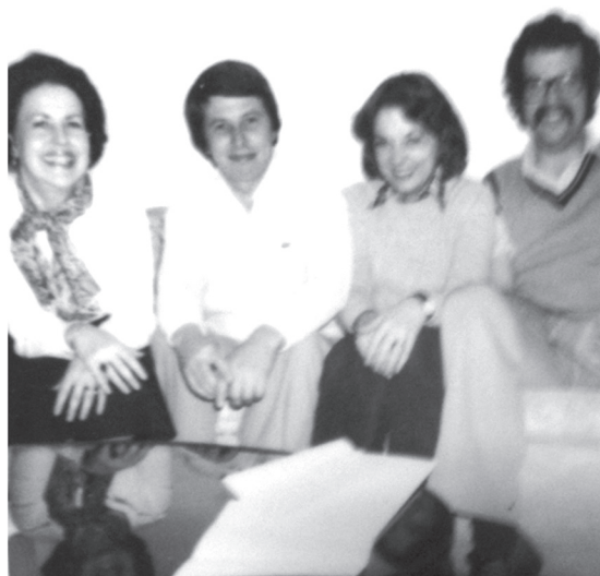
Early OHS Members

We are excited to see what the next 40 years will bring!