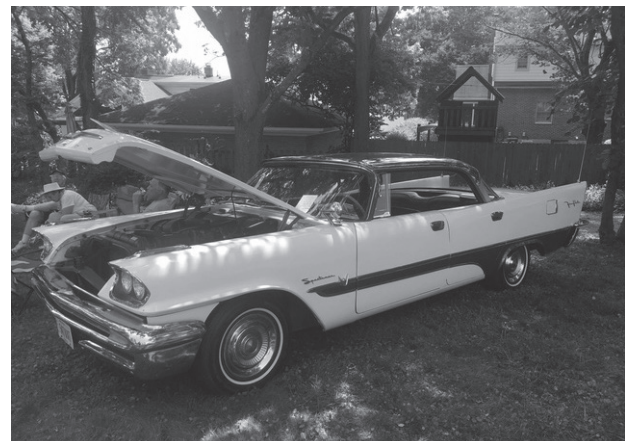
1957 DeSoto at the 2018 Classics on the Lawn