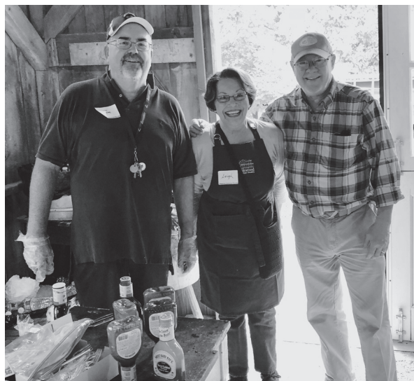
Help support your Oakwood community resource with membership in the Historical Society

It's possible to join online at http://www.oakwoodhistory.org/get/join.html or with the form on the last page of this newsletter.