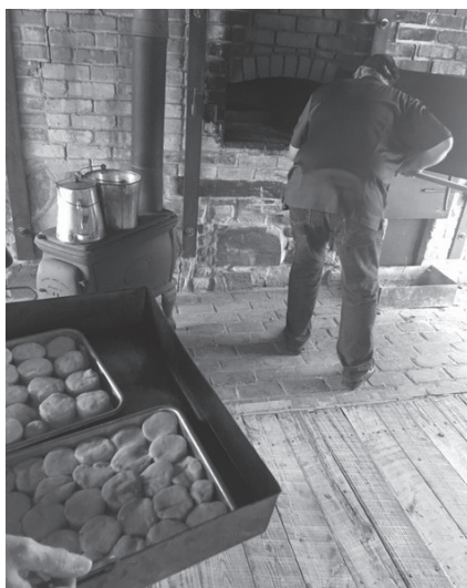
Old-time baking techniques using this wood-fired brick stove at Fort Gibson