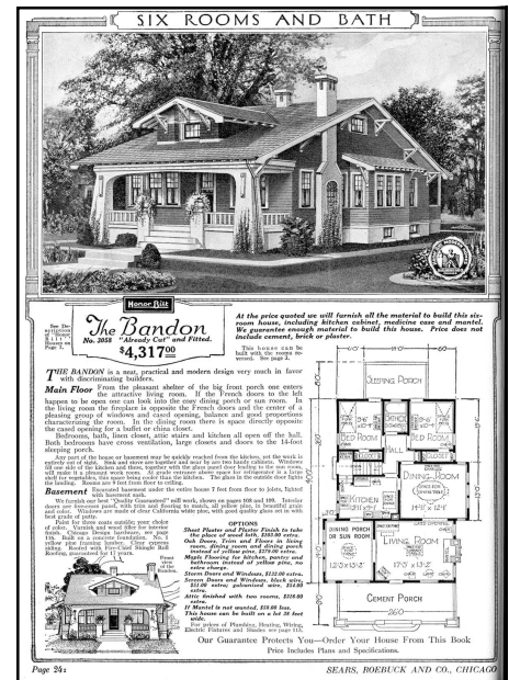
An example of a Sears Pattern Book home illustration from the early 1900s.

Between 1890 and 1930 more houses were erected in our nation than ever before. This rapid growth of suburban areas also defined a new style of mass-produced architecture. These sub urban neighborhoods were trying to connect the rural landscape and "American way of life" within an urban setting. The houses had to appear spacious with large lots, but in reality, to maximize the limited space along the streetcar lines, the lots and houses were very modest. Sears and Aladdin sales catalogs rarely showed a house along a developed streetscape. Instead, they depicted a single house on a lot with no neighboring houses, illustrating two elevations and surrounded by greenery. Architects created houses with wrap-around porches, front and rear porches, side entries, and wraparound sidewalks. All these elements evoke the sense of a spacious lot and not the