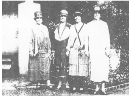
An early photograph of Garden Club of Dayton members during the late 1920s.

The G.C.D. worked toward the conservation of Dayton's natural resources. The women wrote and distributed instructions for planting Ohio native flowers and vegetables. The G.C.D. organized a contest with the Boy Scouts to build 200 window boxes for shut-ins around Dayton and supplied native plants for the completed project. Members planted permanent Christmas trees in their lawns refusing to cut a tree down and encouraged others to do the same. The G.C.D. advocated the preservation of natural Ohio plants by sending letters to florists and businesses pleading with them to stop purchasing endangered plants including laurel and hollyhock.