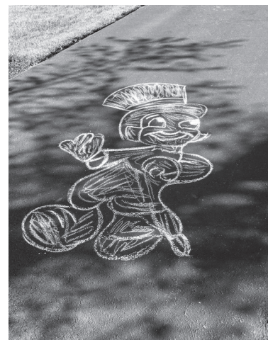
Pandemic "Chalk on Sidewalk" art on West Hadley. Artist unknown