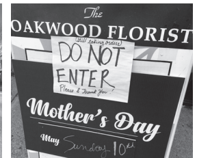
Stay-at-home order leaves Oakwood business district deserted