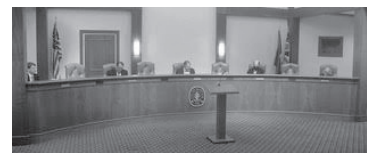
Oakwood City Council