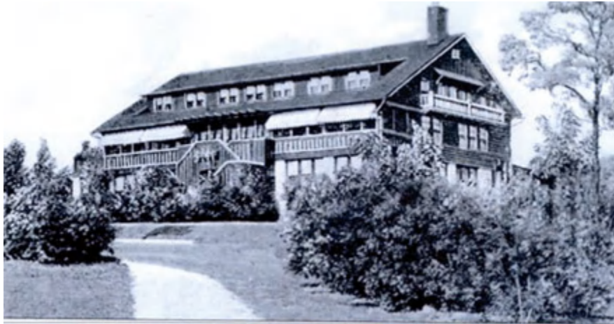
The Old Barn Club

There were two buildings in Oakwood that no longer exist and which always bring comments when I talk about them in various presentations about Oakwood history. The one no one remembers because it has been gone so long, and the other brings back memories and wistful regrets that it's no longer here. I write of The Old Barn Club and Runnymede Playhouse.